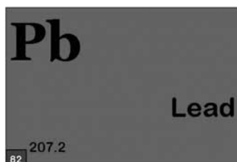
Symbol for lead. Periodic Table of Elements.