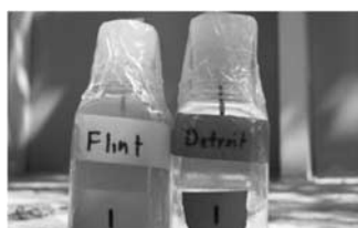
Flint Water Crisis.