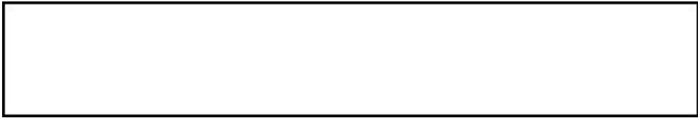
Figure 1. This is a widefig. This is an example of long caption this is an example of long caption this is an example of long caption this is an example of long caption.

Environments such as figure, table, equation, align can have a label declared via the \label{#label} command. For figures and table environments one should use the \label{} command inside or just below the \caption{} command. One can then use the \ref{#label} command to cross-reference them. As an example, consider the label declared for Figure 1 which is \label{fig1} . To cross-reference it, use the command Figure \ref{fig1} , for which it comes up as “Figure 1”. The reference citations should used as per the "natbib" packages. Some sample citations: Herbst-Damm and Kulik (2005) ; Gilbert et al. (2004) ; Light and Light (2008) ; Shotton (1989) ; Schiraldi (2001) ; VandenBos (2007) ; Freud (1953) .