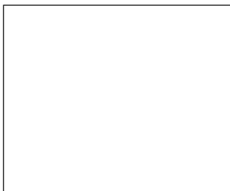
Figure 3. An example figure with space for artwork.