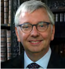
Professor Stephen Toope (Chair of Syndics)

Vice-Chancellor of the University of Cambridge