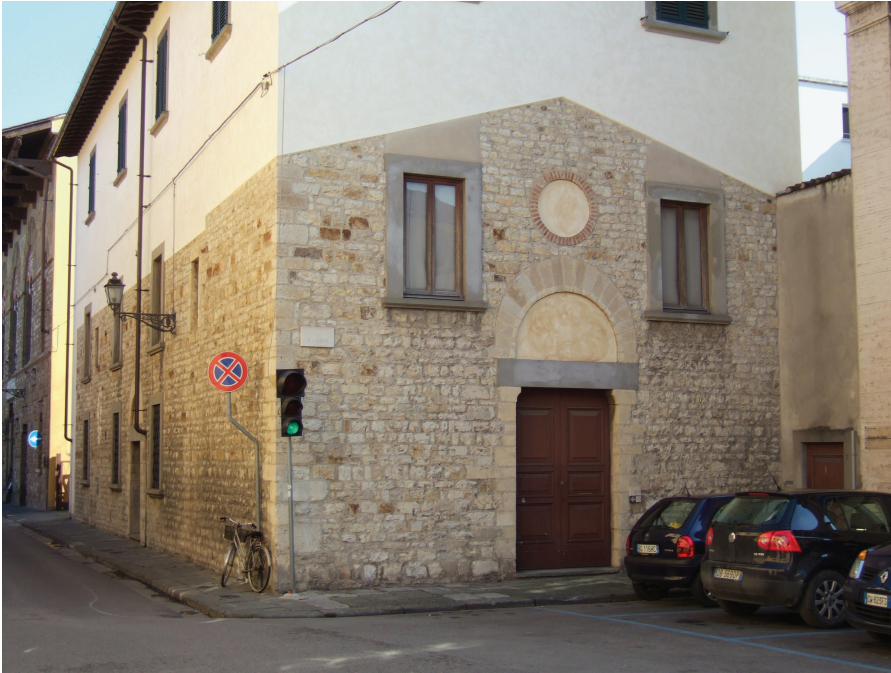
10 Remains of San Jacopo, Prato.