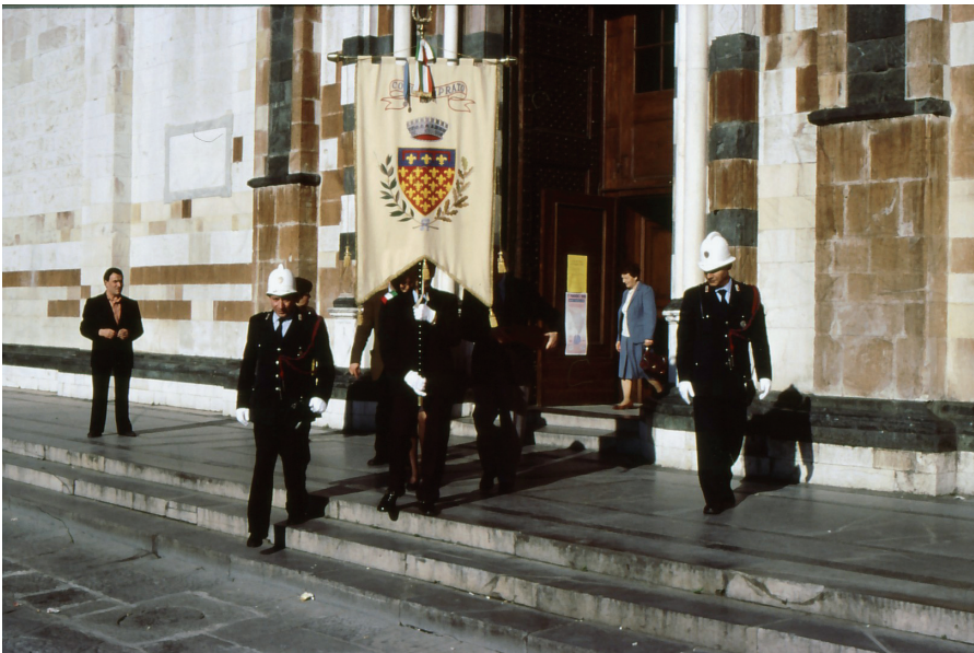
7 The return of the keys of the reliquary of the Holy Girdle, 3 May 1999.