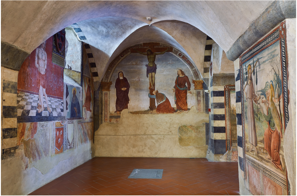
3 Guizzelmi chapel, Cathedral of Santo Stefano, Prato from the north.