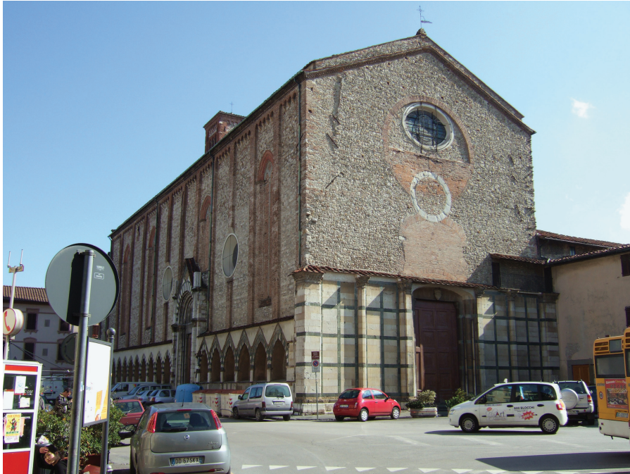
8 San Domenico, Prato.