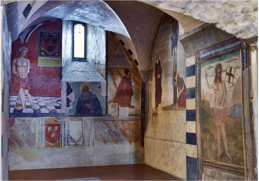
6 Guizzelmi chapel, Cathedral of Santo Stefano, Prato from the west.