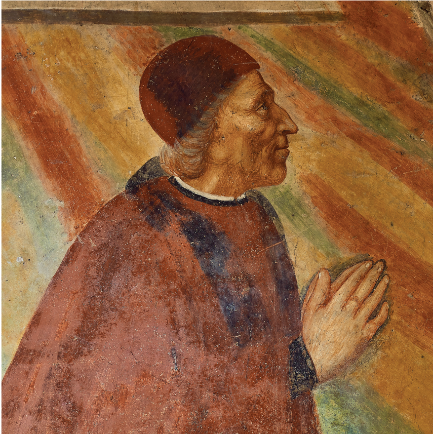
1 Portrait of Giuliano Guizzelmi , 1508, fresco, Guizzelmi chapel, Cathedral of Santo Stefano, Prato.