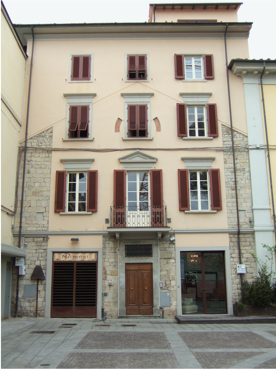
14 Remains of S Maria in Castello, Prato.