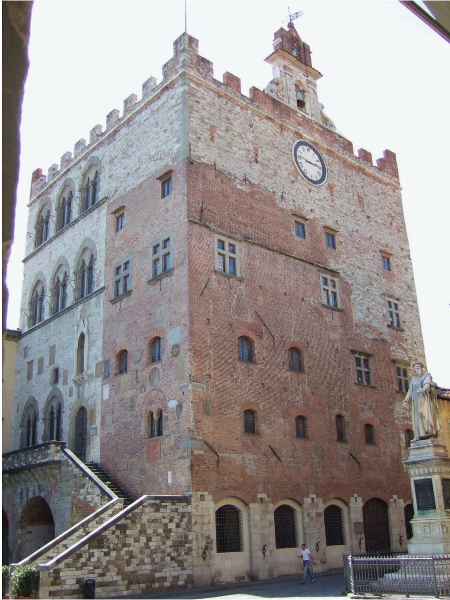
15 The Palazzo Pretorio in the Piazza del Comune, Prato.