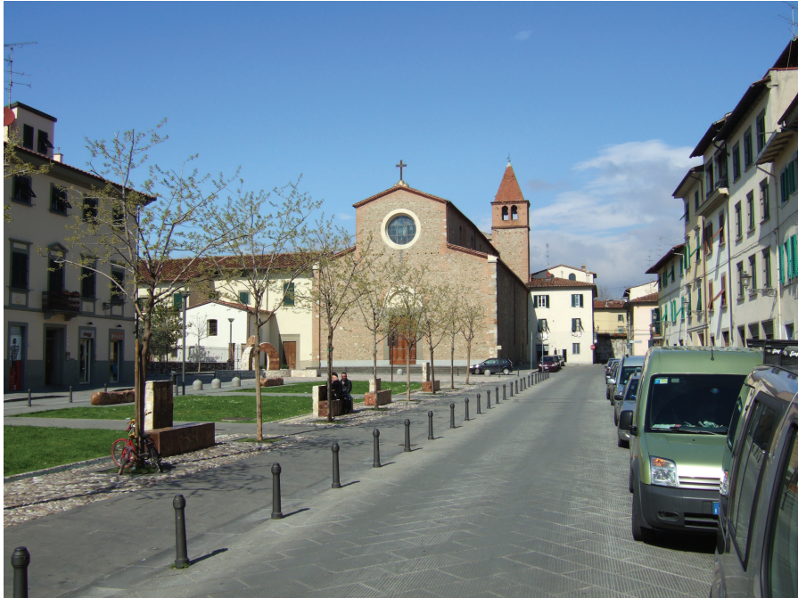
12 Sant'Agostino, Prato.