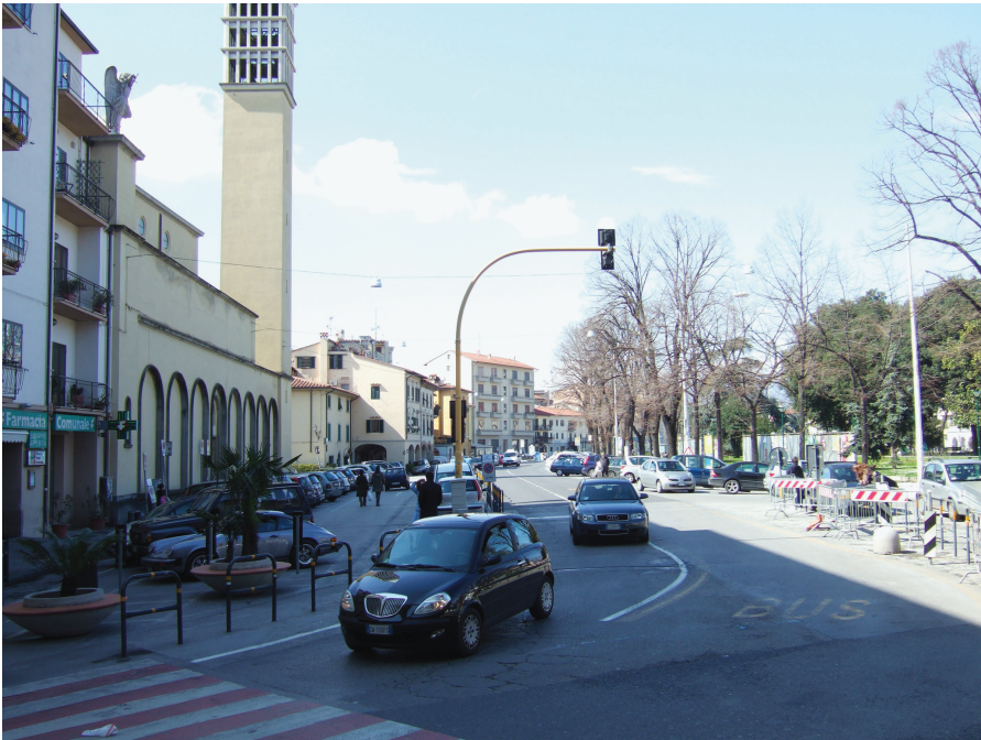
11 The Piazza Mercatale, Prato, looking west, with the former Carmelite church of San Bartolomeo on the left.