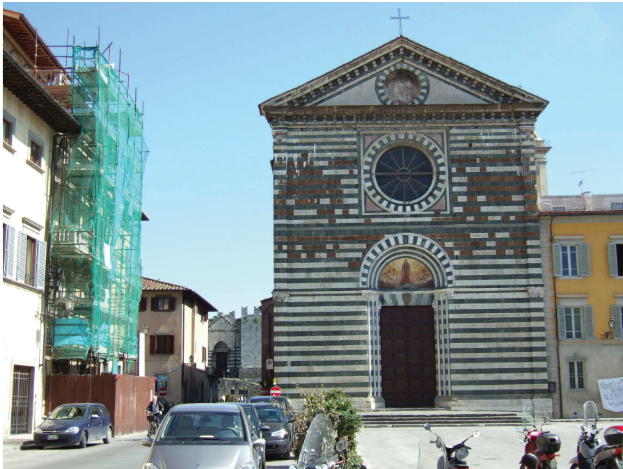
13 San Francesco, Prato.