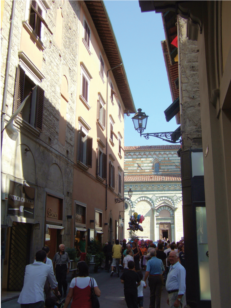
2 Via Mazzoni, formerly Via de' Sarti, looking north towards the cathedral of Santo Stefano, Prato.