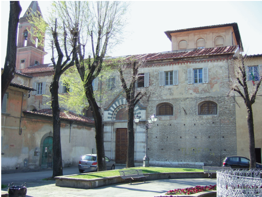
9 San Niccolò, Prato.