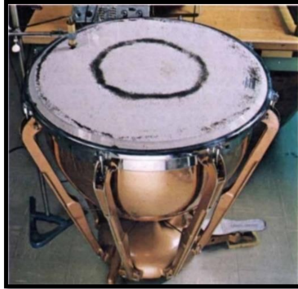
Fig. 3. Standing wave pattern on a kettledrum head. One of many possible standing wave patterns on a kettledrum head, made visible by dark powder sprinkled on the drumhead. As the head is set into oscillation at a single frequency by a mechanical oscillator at the upper left of the photograph, the powder collects at the nodes. By the same way, due to the oscillation of the solar system wave function the dust grains and gas of the solar system protoplanetary disk were grouped in certain orbits.