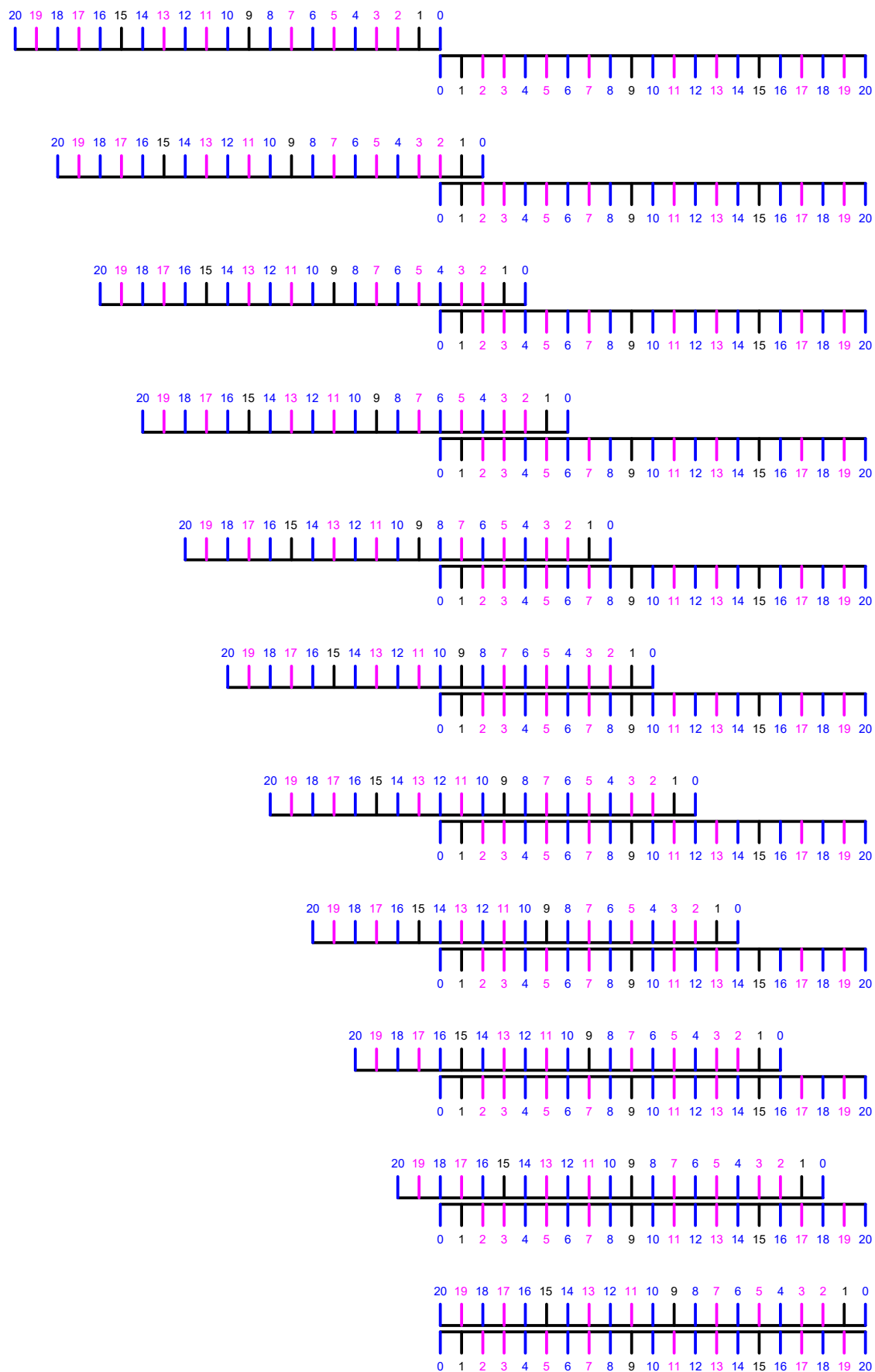
Figure 2. Representing partitions of even numbers between 0 and 20