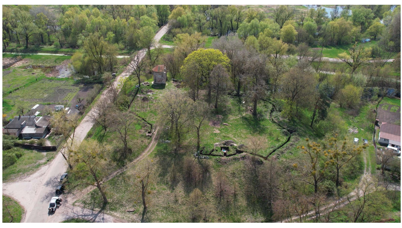
Frontispiece 2. Aerial photograph of Kannuus Cesmozo IOpa (St George Chapel), citadel, and previously unrecorded graveyard from the twelfth century AD, at Oster, Chernihiv Oblast, Ukraine, April 2023. The standing remains of the twelfth-century brick church are in the background, with infantry defensive trenches along the edge of the mound. These were constructed in March 2022 during the Russian invasion of Ukraine. On-going photogrammetry and field research demonstrates that the 200m of military entrenchments at Oster have destroyed parts of the citadel, the church and extensive early medieval graves. This research is part of a wider international collaborative project between the Archaeological Landscape Monitoring Group, National Taras Shevchenko University of Kyiv, Ukraine, the Institute of Archaeology, the National Academy of Sciences, Ukraine, and the University of Notre Dame, USA.