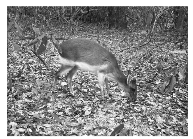
PLATE 1 Aders' duiker photographed on 26 September 2008 in the Boni National Reserve (Fig. 1).

obtained on local names for blue duiker Cephalophus monticola or bush duiker Sylvicapra grimmia.