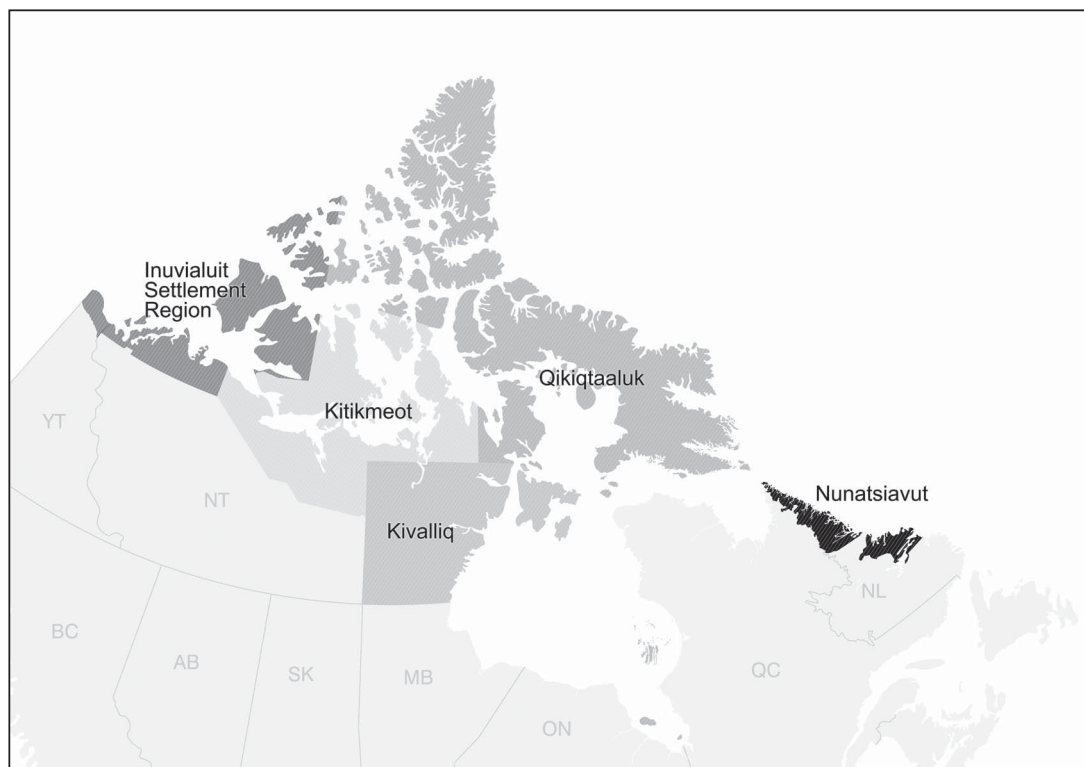
Fig. 1 Map of the participating Inuit regions* of the 2007–08 Inuit Health Survey. *Nunavut is comprised of the Kitikmeot, Kivalliq and Qikiqtaaluk regions

The survey was cross-sectional, employing a stratified random sampling of households in thirty-three coastal