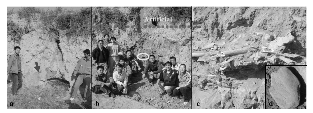
Figure 2 a) The original cliff where a small piece of bone (arrow point) was discovered during a student excursion; b) the students on the field trip. After the cliff was cleaned, large amounts of fossil bones and teeth, ceramics, and artifacts were found (circled area). The dotted line marks the boundary between upper artificial material and the lower original loess-paleo-sol sequence; c) the fossil bones and teeth of sheep and horses; d) artifact (stone tool) used to smash the bones for marrow.