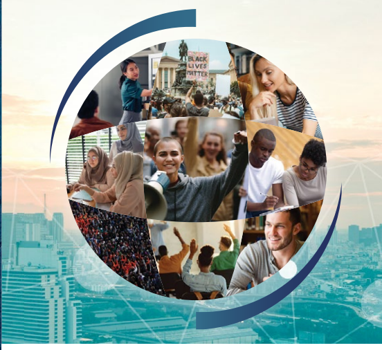
AMERICAN POLITICAL SCIENCE ASSOCIATION