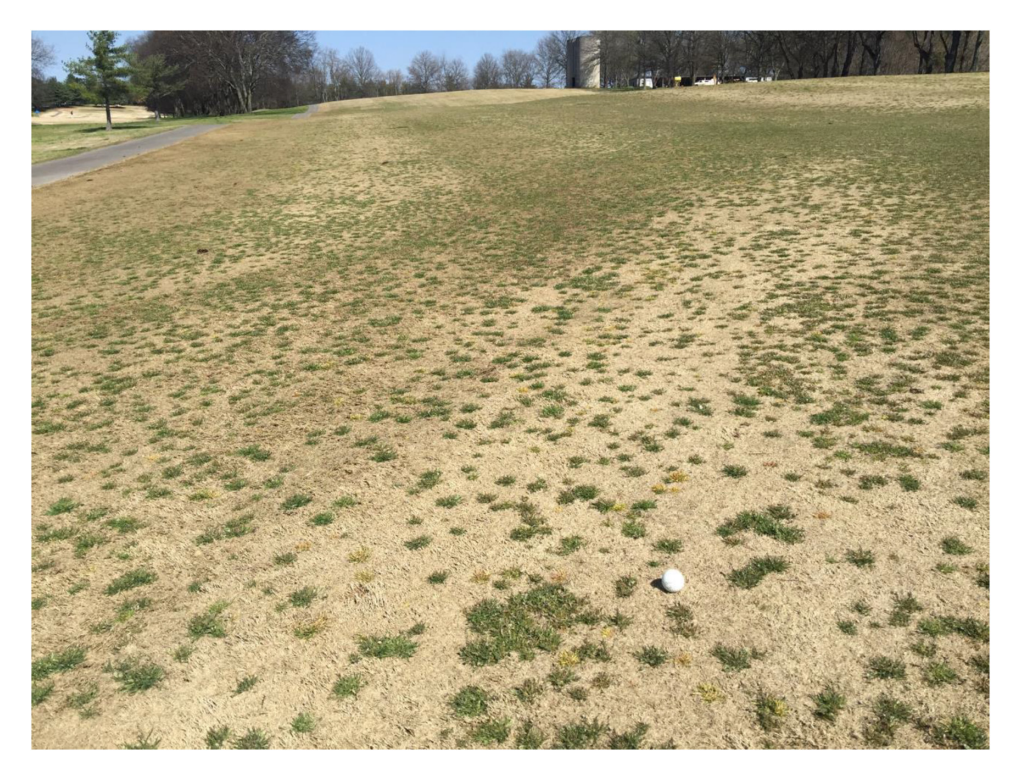
Figure 1. Glyphosate-resistant annual bluegrass (Poa annua L.) infesting a dormant bermudagrass (Cynodon spp.) golf course fairway in Rockford, TN.

thoughts on how continued evolution of herbicide-resistant weeds in turfgrass may affect weed management specialists on golf courses, sports fields, and lawns.