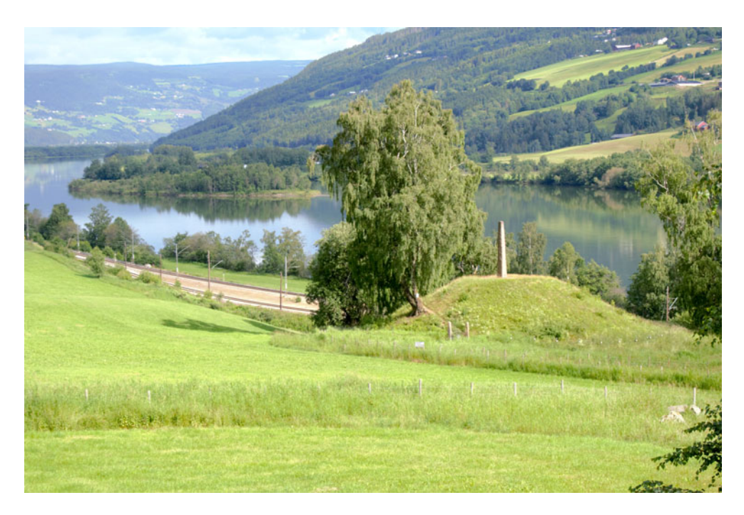
Figure 1. The southeast of central lowland Sør-Fron, seen from the north-eastern mound at Hundorp. The mound to the right is the easternmost mound at Hundorp. The obelisk on the mound was raised in 1907.

purpose of Schøning's journey. There are indeed many mounds known from later sources that Schøning never described and that he probably never visited, such as the cluster at Kjorstad (see Figure 2). The seven clusters that Schøning describes are thus not all the local mound groups; Schøning's clusters and the cluster at Kjorstad are merely a minimum number of clusters that had survived by 1775. Allowing for the possibility that mounds had been demolished not just after but also before the 1770s suggests that some of the clusters observed in 1775 were once part of a continuously monumentalized landscape with no clearly defined centre. Hypothetically, some of the mounds in Sør-Fron could have been built at the command of elites, but if we were to interpret all these clusters as centres of dynastic power, we would be left with a myriad Late Iron Age dynasties of chiefs