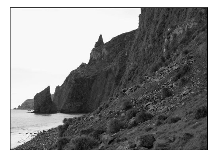
Figure 2. Isolated penguin colony within large areas of apparently suitable habitat on the east coast of Gough Island, characterised by short, weedy plants typical of recently vegetated areas.