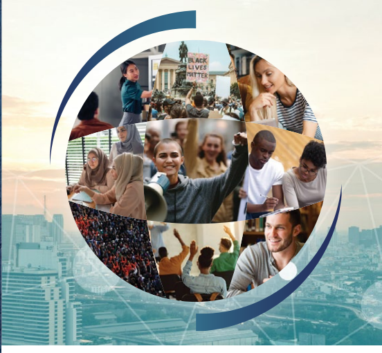
AMERICAN POLITICAL SCIENCE ASSOCIATION