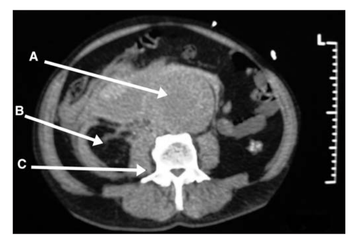
Fig. 1. A CT scan showing a large 9-cm infrarenal aortic aneurysm extensively leaking around the right kidney and psoas muscle. A = ruptured abdominal aortic aneurysm; B = right kidney; C = right psoas muscle surrounded by blood.

As to why a CT scan was chosen over a bedside ultrasound, the need to establish the presence of a leak was of far greater consequence than identifying the diameter of