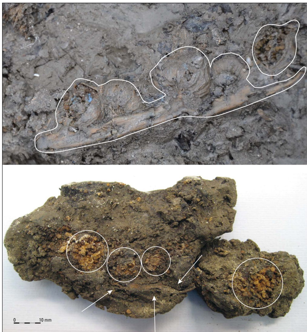
Figure 3. Details of the black henbane inflorescence from the enclosure ditch deposit, pictured as it was in the field (top) and post-excavation in the lab (bottom). White circles mark the concentrations of seeds from the fruits and arrows indicate the remains of the stem (images reproduced from van Renswoude et al. 2017: fig. 20.12; Kooistra 2017: fig. 16.5).

higher up in the fill of the water pit, when it was out of use, they have been interpreted as an abandonment offering (van Renswoude 2017: 136). Finally, a horse appears to have been buried in the top fill of the pit during the second century—based on stratigraphy and ceramics. The skeleton was incomplete and butchery marks were present on some of the bones (Groot & van Haasteren 2017: 692). While the two partial skeletons with butchery marks may represent food remains, their occurrence in combination with several unusual finds suggests that they, too, were offerings.