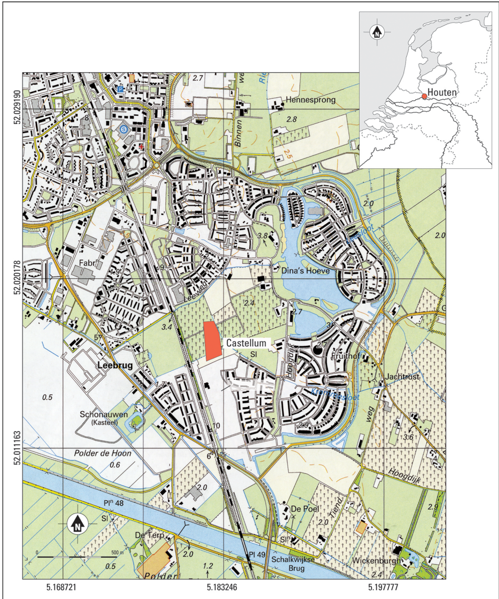
Figure 1. Map showing the location of the Castellum site in the municipality of Houten in the Netherlands (after van Renswoude & Habermehl 2017: fig. 1.1).

The archaeological site of Houten-Castellum reveals the remains of a rural settlement in the central Netherlands (Figure 1), which was inhabited from the Early Iron Age (sixth century BC) to the Roman period with a hiatus in the first century BC (van Renswoude &