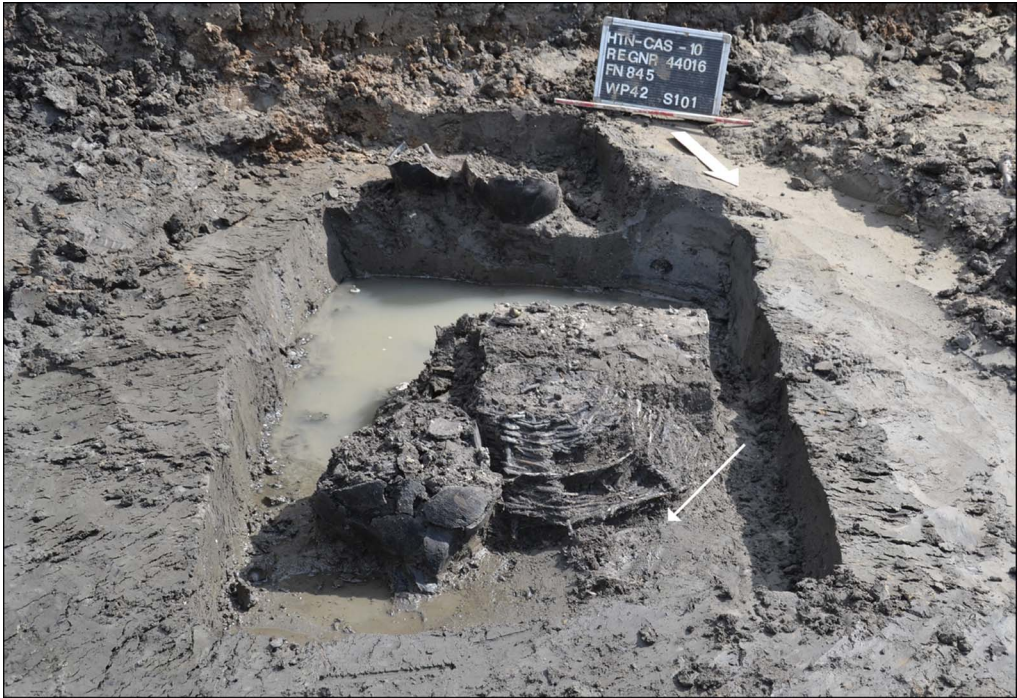
Figure 2. Excavation photograph of a deposit within the enclosure ditch containing a basket, pots and black henbane (lower arrow) (reproduced from van Renswoude et al. 2017: fig. 20.12).

was intentionally closed at one end indicate deliberate use of the bone as an object. The metaphysis of the femur, where the bone widens to form the knee joint, would have provided a natural closure to the shaft, but the internal bone structure is very porous here. Instead, this area was hollowed out and the plug was inserted into the bone. There is no evidence that the bone cylinder was closed at the other end but it is possible that a perishable material such as leather or textile was used. The hollow chamber inside the bone is approximately 59mm long with a diameter of 9mm, allowing a rough estimation for volume of 3.75\text{cm}^3 .