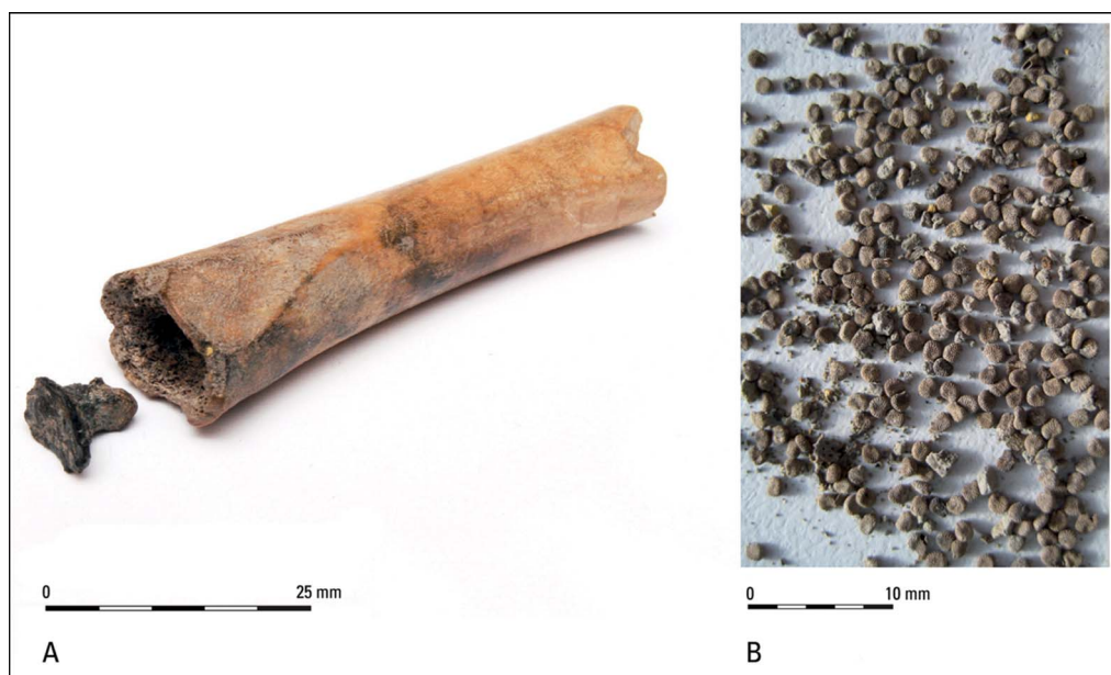
Figure 5. A) The bone cylinder and plug (reproduced from Groot & van Haasteren 2017: fig. 14.14B); B) black henbane seeds.

of GC-MS showed that both ends of the plug were almost identical. A sample from the flat outer part of the plug contained the highest proportion of organic material and was further analysed by infrared spectrometry and scanning electron microscopy with energy-dispersive x-ray spectroscopy (SEM & EDS). The presence of the diagnostic biochemical marker betulin indicates that the plug consists of birch-bark tar (Figure 6). Also identified were alkaloids including hyoscyamine—characteristic of black henbane—and fatty acids from oily plant seeds, which could also derive from black henbane.