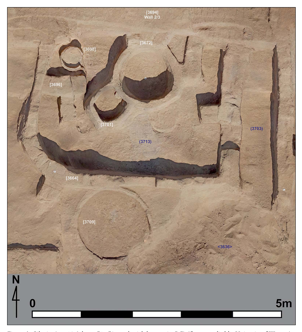
Figure 4. Silos in Area 10 (phases C1–C2, tenth-eighth centuries BC).

were found fragmented in secondary deposits. Storage jars (most probably for water) were positioned in cuts in the floors of some rooms (Wodzińska 2019: 95). The remains of about a dozen small conical cups (Figure 6D), probably used for drinking, were found loose on the floors or in small cuts in the floors (Wodzińska 2019: 95, fig. 9). The pottery appears to have been made locally, though a few imported amphorae (e.g. Figure 6G) show small-scale international trade.