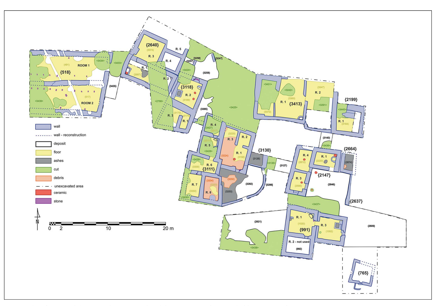
Figure 2. Plan of structures belonging to phase C3a (tenth-eighth centuries BC).