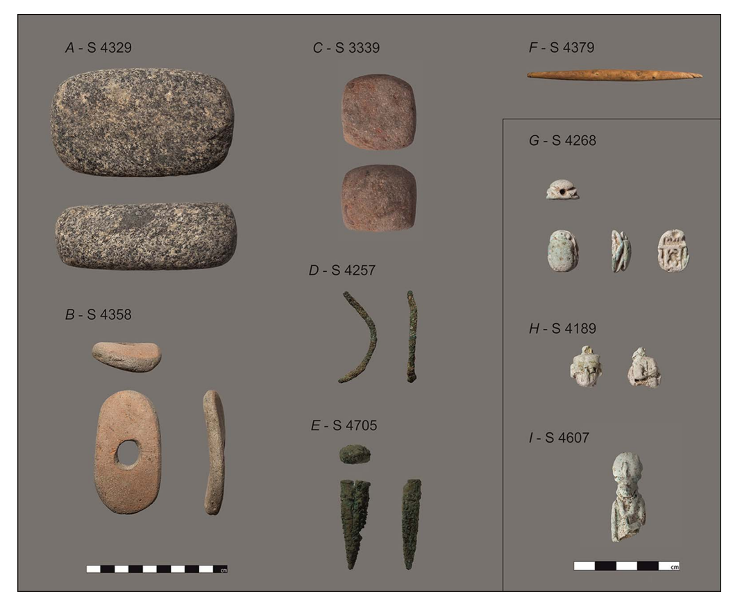
Figure 5. Examples of objects found inside the houses at Tell el-Retaba: A) grinder; B) scraper made of a potsherd; C) cuboidal grinder; D) bronze needle; E) bronze strainer; F) bone needle; G) faience scarab; H) faience pendant depicting Pataikos; I) faience pendant depicting one of the Egyptian goddesses Bastet or Sakhmet.

cups that are also found at Memphis; Aston 2007: fig. 29, nos. 167–176 and fig. 31, nos. 207–214), which cover the Twenty-first Dynasty. However, most of the material comes from the Twenty-second Dynasty (phases C1–C3). So far, no pottery characteristic of the Twenty-fifth Dynasty has been recovered at Tell el-Retaba.