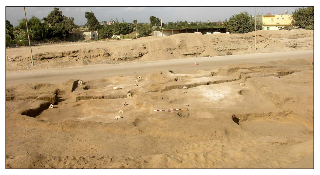
Figure 3. Excavation of stable 518 (phases C1–C3, tenth-eighth centuries BC).

The assemblage of ceramic vessels from TIP domestic contexts includes closed forms—mostly large storage jars with two vertical handles (Figure 6A & B) and cooking pots (Figure 6C)—and open forms—mostly used during the preparation and consumption of food (e.g. Figure 6D & E), including bread baking (Figure 6F). The majority of vessels