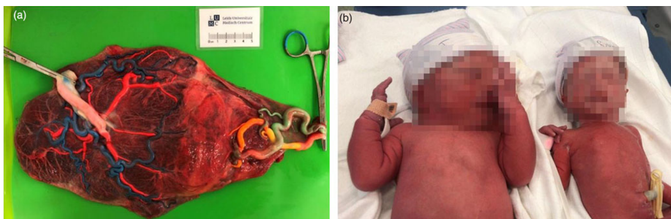
Fig. 2. Selective fetal growth restriction: (a) an injected placenta demonstrating an unequal placental share division (79% vs. 21%) and a laser demarcation line following fetoscopic laser surgery for coexistent TTTS; (b) an MC twin pair affected by selective fetal growth restriction treated at the LUMC (gestational age at birth 32 weeks, birth weights 2300 and 1200 g). The larger placental share (a, left) belonged to the larger co-twin (b, left).

collected in a sterile PBS-antibiotic/antimycotic solution on birth as a source of MSCs. MSCs are cells of mesodermal origin with the capacity to differentiate into multiple cell types including osteoblasts, adipocytes and chondroblasts using specific culture conditions (Swamynathan et al., 2014; van der Garde et al., 2015). MSCs can be obtained from umbilical cord without any risk for the donor and expanded to high numbers for experiments. For MSC isolation, a modified explant method operational at the LUMC will be adapted and standardized (van der Garde et al., 2015). After expansion for approximately 10 days, the explants are removed and the MSCs are transferred into culture flasks. The transferred cells will be grown to >70% confluence, frozen and stored until further expansion is required. Subsequent MSC expansions of MSCs obtained from co-twins will be performed simultaneously to minimize batch effects. The uniform classification system for MSCs, introduced by the International Society of Cellular Therapy, will be adopted to ensure unambiguous identification and separation