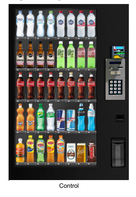
Traffic Light System

Fig. 1 The two vending machine conditions featured in Study 1.