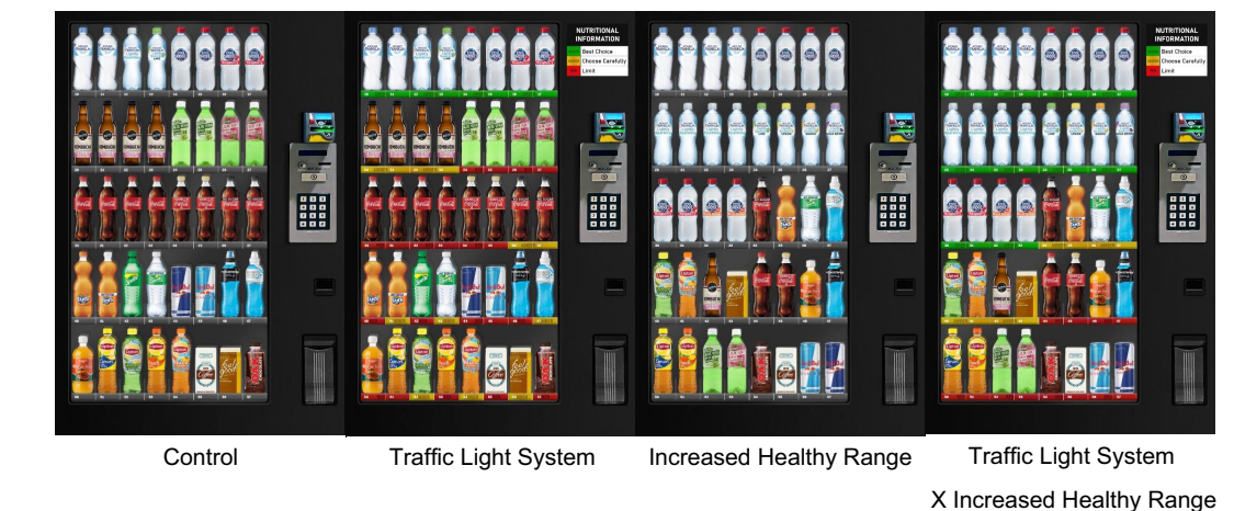
Fig. 2 The four vending machine conditions featured in Study 2.