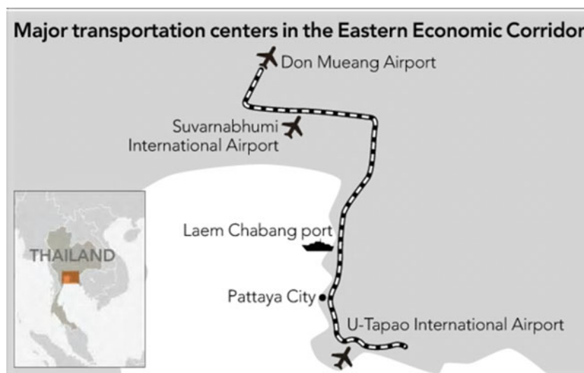
Figure 1. Thailand's EEC and the planning for high-speed rails.

(as part of the Pan-Asia railway) and Japan-financed Bangkok–Chiang Mai railway have created technical difficulties for railway connections in Thailand (Sako, 2019a). However, the Thai government was reluctant to finance the project solely through government funding and did not wish to bear a heavy financial burden for HSR construction. Therefore, Thailand announced that the government would merely cover 20% of the overall investment, while the rest of the budget would come from other ways including mainly SOE borrowings and PPP (Fujita Corporation et al. , 2017). In this context, the Thai government welcomed investments from foreign enterprises.