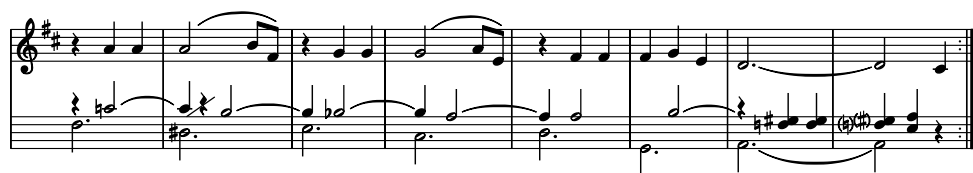
c My reading