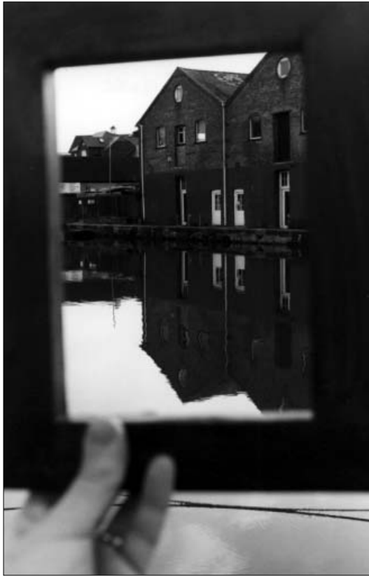
Through the picture frame. Another of the sites on Exeter Quayside for The Quay Thing by Wrights & Sites, Summer 2000.