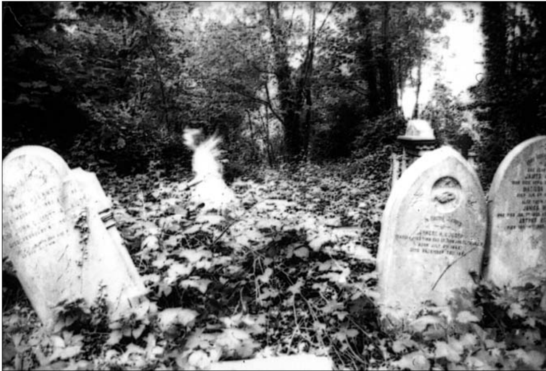
Sirens Crossing, Trace and Flight: 1 , performed as part of the Stoke Newington Festival in June 2000 at Abney Park Cemetery, London N16 (choreographer: Carolyn Deby; dancer: Pia Nordin).

establish a particular relationship between the performance and the site. Cathy Turner of Wrights & Sites finds that 'a work can be more or less aggressive in its assertion of itself within the space' and prefers to work with an idea of performance that 'may be no more than a set of footprints in the sand'. The notion of 'building into' or 'dressing' a space, adding to it as part of a performance, might be an attempt to create a stage environment within the location, so reducing the physical aspects of that location available to be worked with, but it might alternatively offer 'an interesting way of responding to and interrogating the space' (Storm).