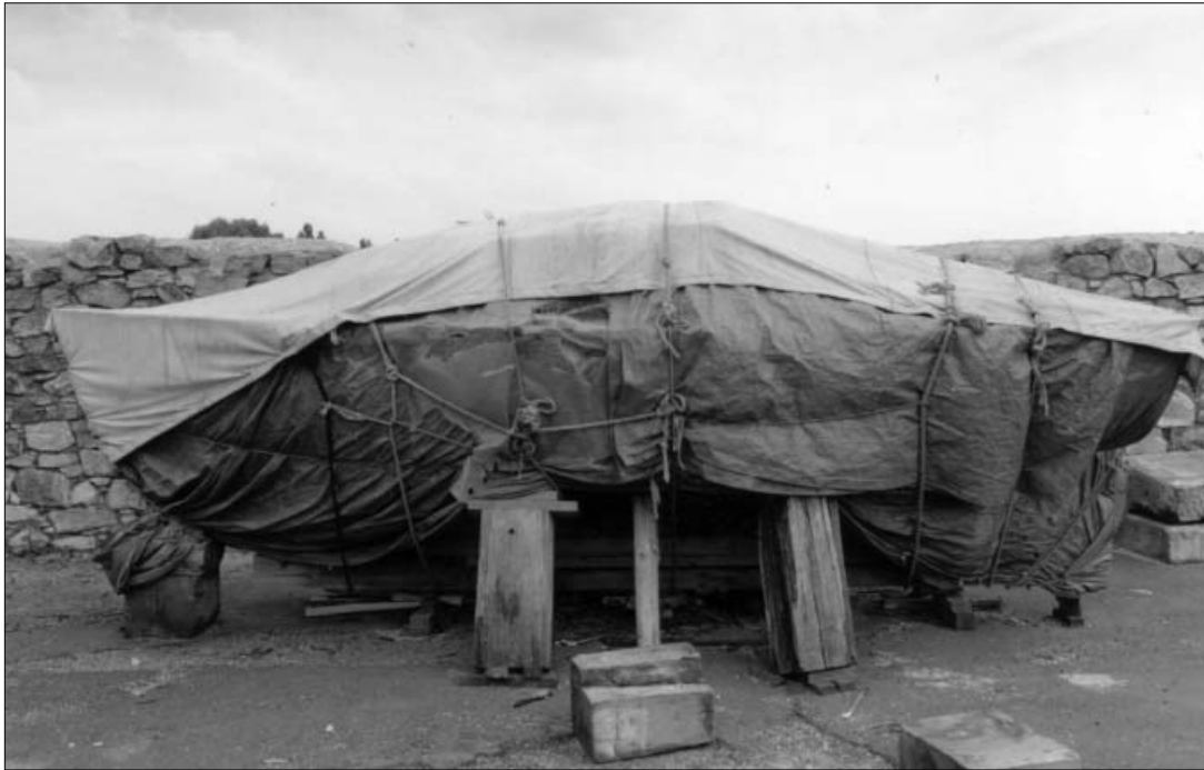
Exeter Quayside: one of the sites for The Quay Thing by Wrights & Sites, Summer 2000.

moves away from the highbrow associations of the theatre and closer to reaching a public well-versed in the popular culture of gigs, festivals, and celebrations. It emphasizes the significance of the spatial encounter and is conceived as a whole experience for the spectator.